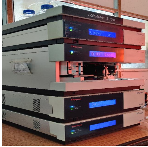
High Performance Liquid chromatography